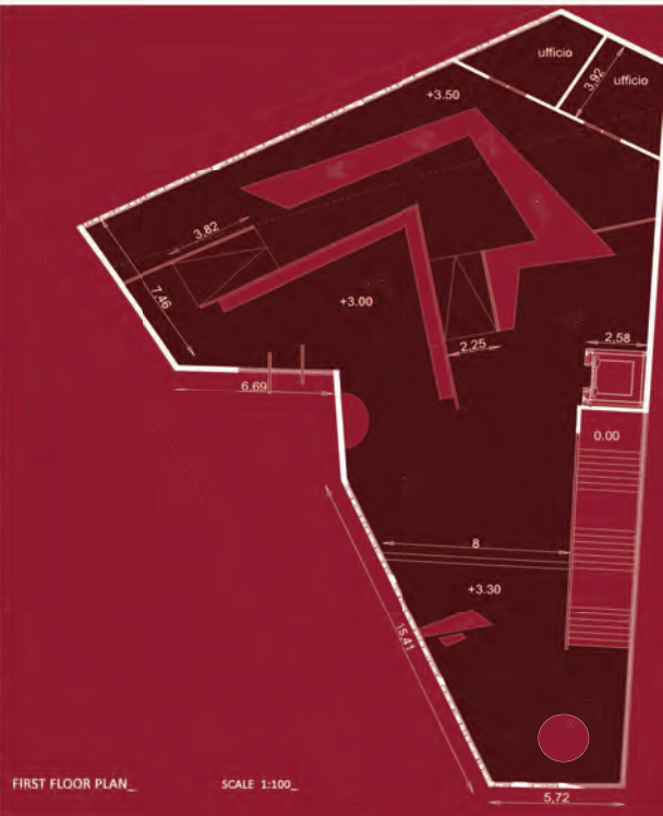
FIRST FLOOR PLAN_ SCALE 1:100_