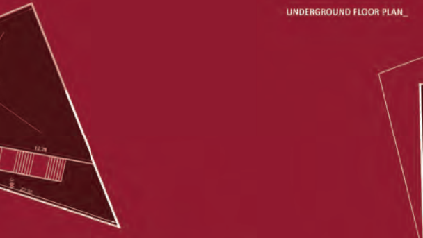
UNDERGROUND FLOOR PLAN_ SCALE 1:200