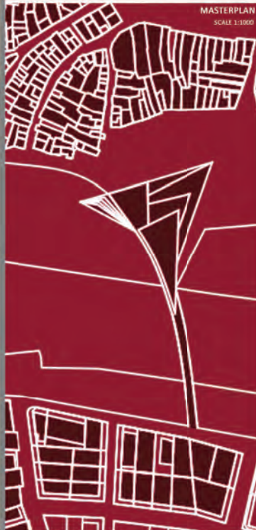
MASTERPLAN SCALE 1:1000